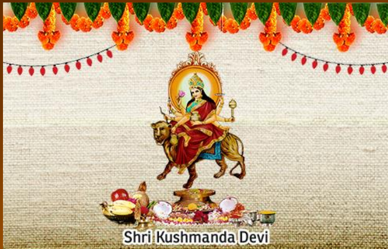
Shri Kushmanda Devi