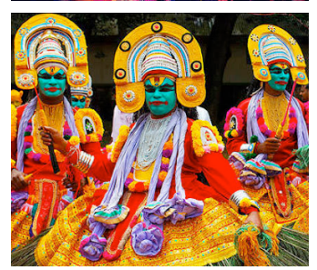
DIWALI DUSSEHRA GANESH CHATURTHI